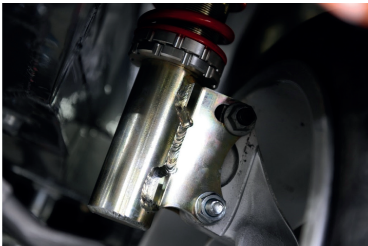
Fig. 6. A fragment of the MacPherson strut