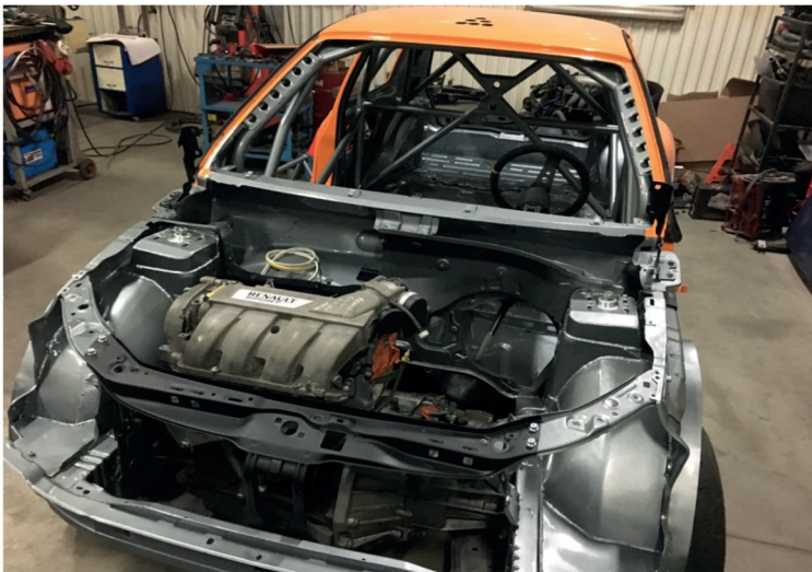
Fig. 4. Engine and gearbox assembly installed in the car body

Following the selection of an appropriate engine, the engine was subjected to modifications. The modifications were made to components of the piston-crank mechanism, valve gear, induction and exhaust systems, and electronic control system. The modifications resulted in satisfactory effects; however, a safety margin was left to the values at which the engine failure rate might dramatically increase [8].