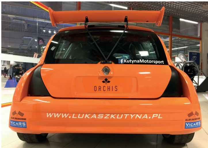
Fig. 9. The car body has been significantly widened

be identical, thanks to which neither any change in the suspension system components nor any modification of the car bodywork will be needed.