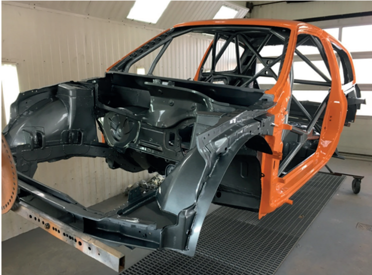
Fig. 3. Car body prepared for the installation of subassemblies