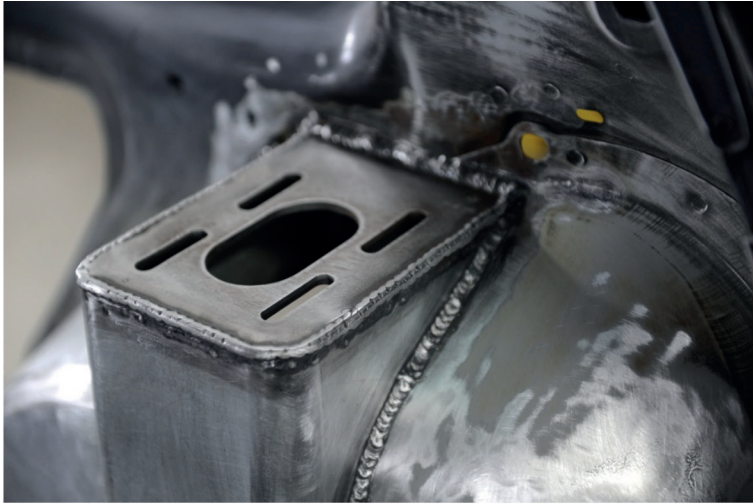
Fig. 5. The rear point of fastening the MacPherson strut to the car body

Special stress was put on precise adaptability of the suspension system to current conditions such as road surface type, weather conditions, or particular properties of a specific section of the route. In consequence, all the suspension system characteristics are adjustable within a very wide range [1, 5, 22].