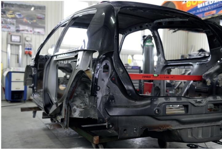
Fig. 1. Car body during the preparatory work

For the design basis adopted to be implemented in the final vehicle version, the car body had to be modified so as to increase its strength, to enable a wide range of adjustments of the vehicle running characteristics that may be affected by the car body shape and dimensions, to adapt the body for mounting the subassemblies having been prepared, and to minimize the vehicle mass [6, 13, 15, 17]. Therefore, the following operations were considered necessary during the designing process: