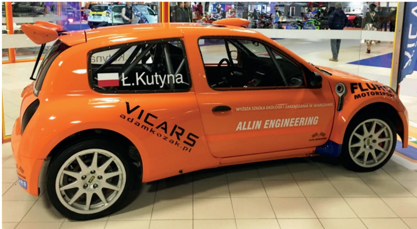
Fig. 8. Finished vehicle officially presented at the Warsaw Moto Show 2017