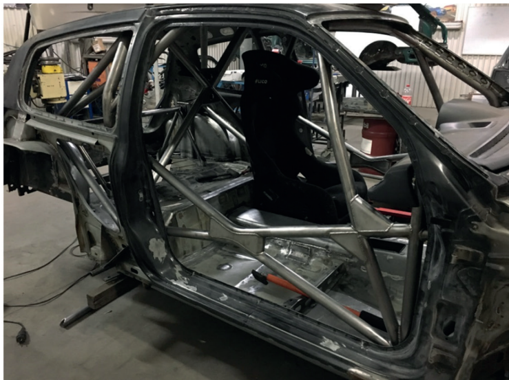
Fig. 2. Roll cage, side part